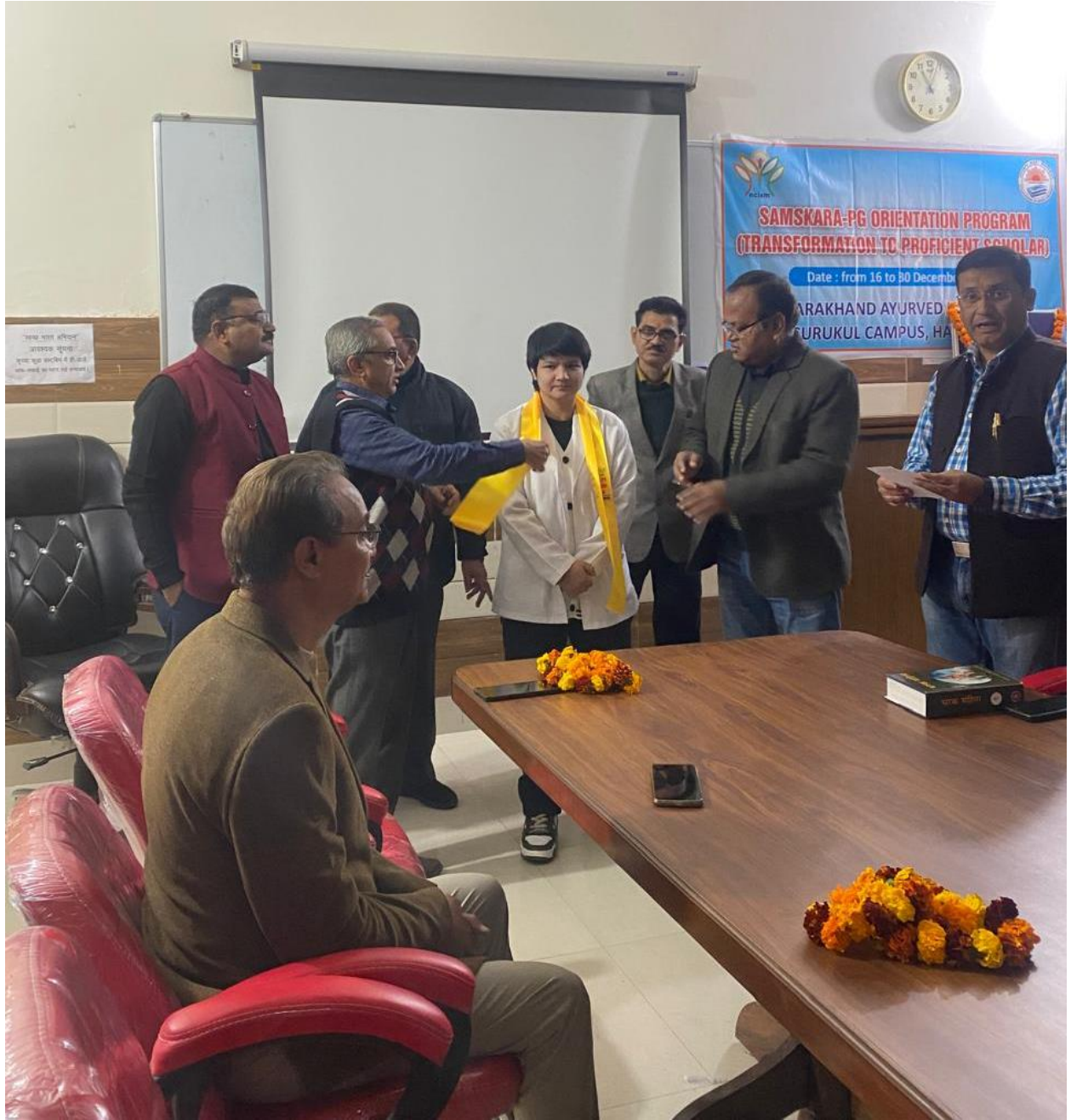
ORIENTATION PROGRAM OF PG SCHOLARS OF UAU GURUKUL CAMPUS.