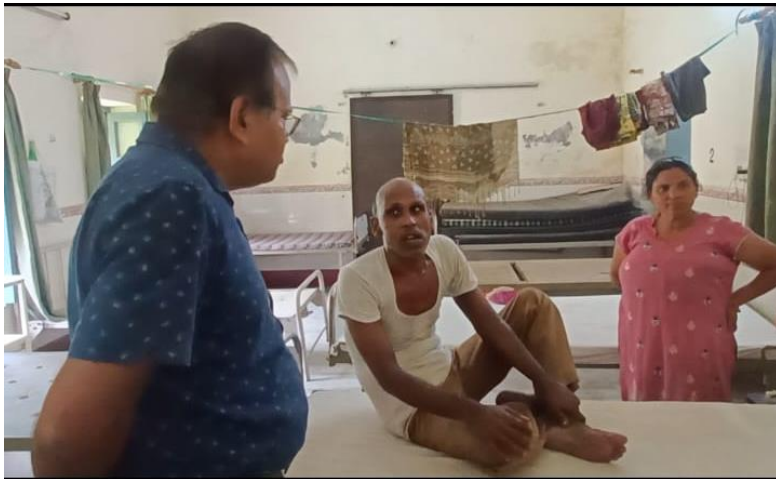
PATIENTS OF KAYACHIKITSA IN IPD