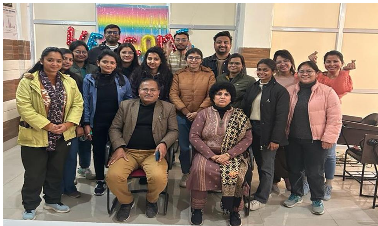
WELCOME PARTY OF PG SCHOLARS OF KAYACHIKITSA BATCH 2023