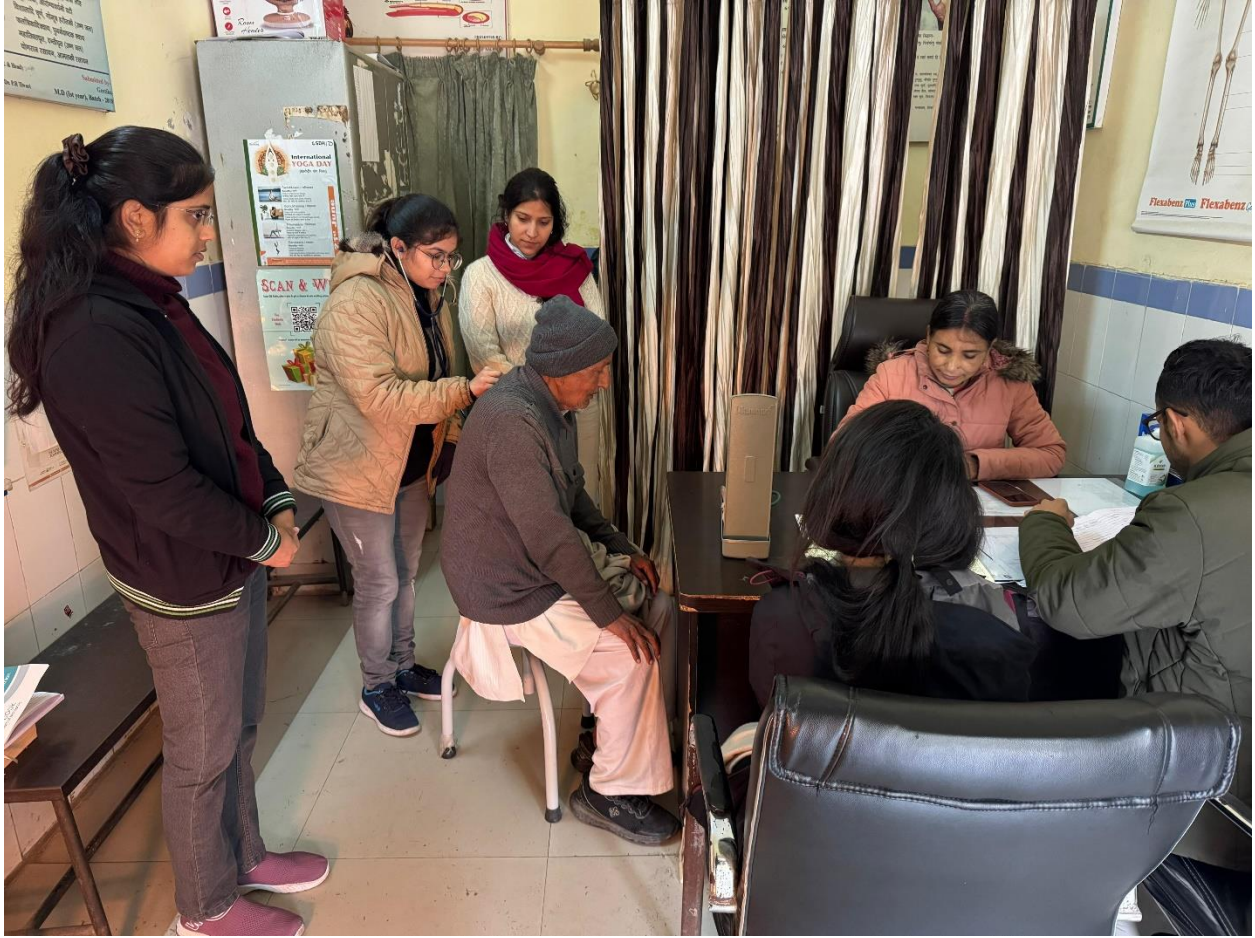
OPD OF KAYACHIKITSA