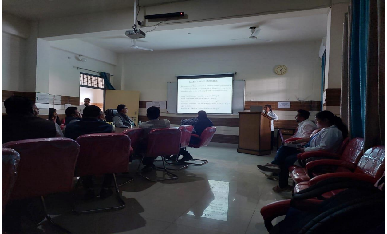
PRESENTATION OF PG SCHOLAR OF KAYACHIKITSA