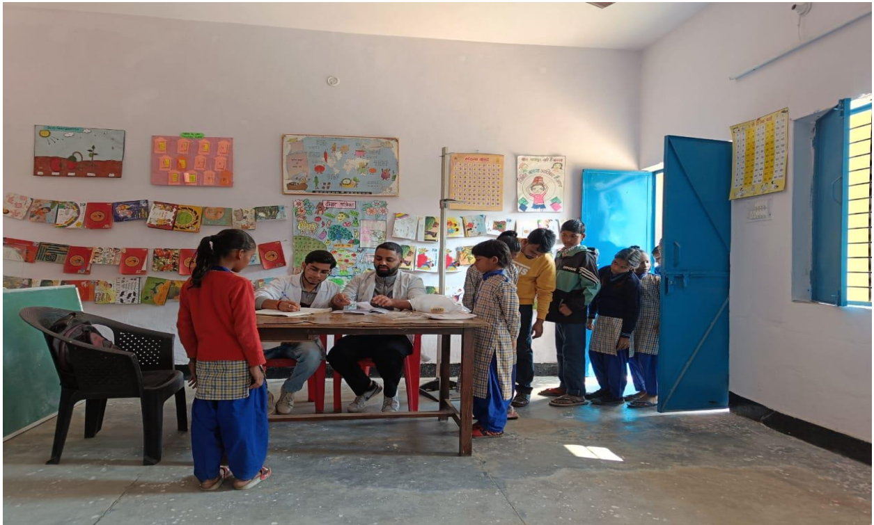
MEDICAL CAMP IN JAMALPUR