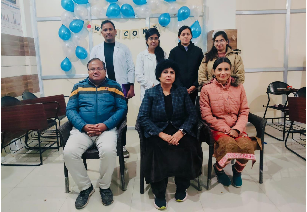
WELCOME PARTY OF PG SCHOLAR OF BATCH 2024